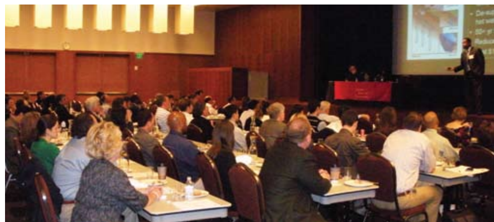
Nearly 70 attendees gathered for Union Bank's first Green Housing Conference.

In May 2009, Union Bank's CDF team hosted its first-ever Green Housing Conference, bringing together leaders from the public, private and nonprofit sectors to discuss methods and motives for building environmentally sustainable housing. Nearly 70 attendees gathered in San Francisco for an afternoon of presentations on topics such as solar energy, green banking and ways to improve energy efficiency in the construction and management of properties.