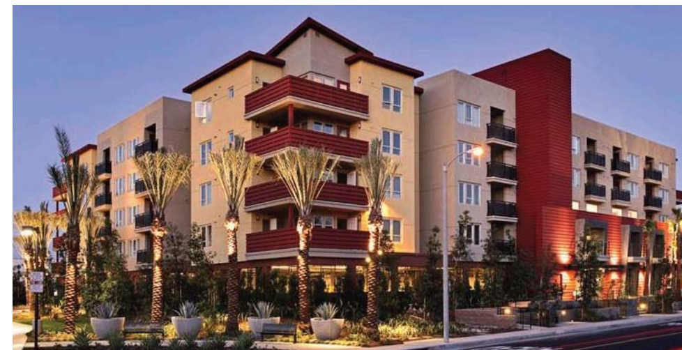
Granite Court in Irvine won accolades for its innovative design.

In 2009, Affordable Housing Finance magazine's "Reader's Choice Awards" and the Gold Nugget Awards each recognized affordable housing developments financed by Union Bank. These award programs are among the nation's most prestigious in the affordable housing field.